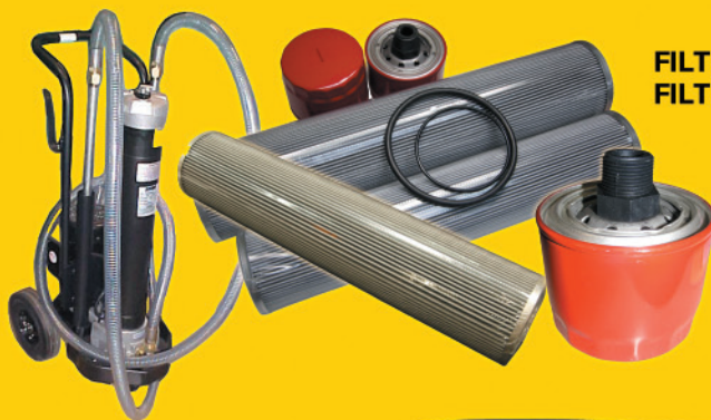
FILTERS AND FILTER CARTS