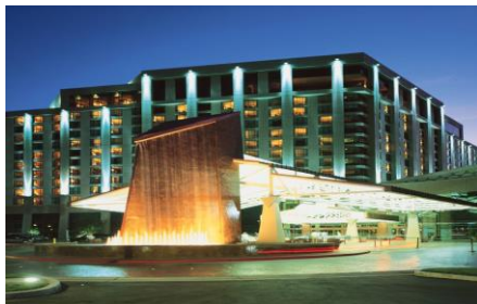
Pechanga Resort & Casino

Tuesday, June 27– Thursday, June 29, 2017 Journey Golf Course at Pechanga Resort & Casino 45000 Pechanga Parkway, Temecula, CA 92592 www.garbagemansinvitational.com